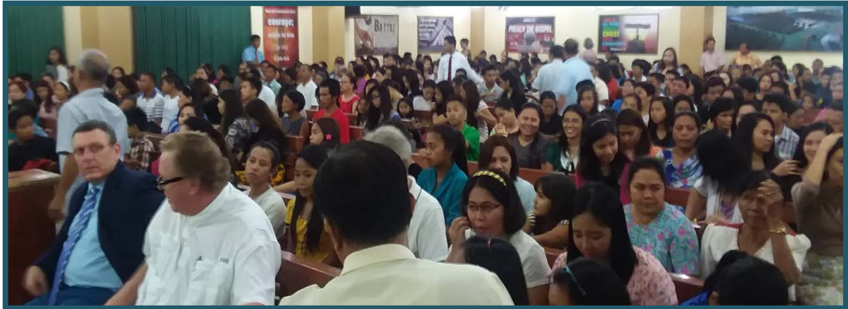
Normal Sunday morning attendance at Lapasan Baptist Church.