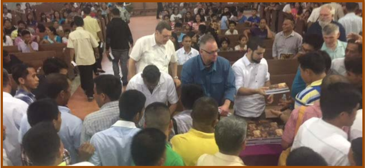
Team Members work to distribute their final round of FirstLove Publications Literature at Maranding.

NOTE: The preaching atmosphere in Maranding was certainly unique. Lizards and cockroaches climb the walls and run across the floor. Birds fly overhead in the building. Sometimes you have to wave off hornets flying around you. In one church that Pastor Nelson preached in, there was a neighborhood dog sleeping in the center aisle during the service.