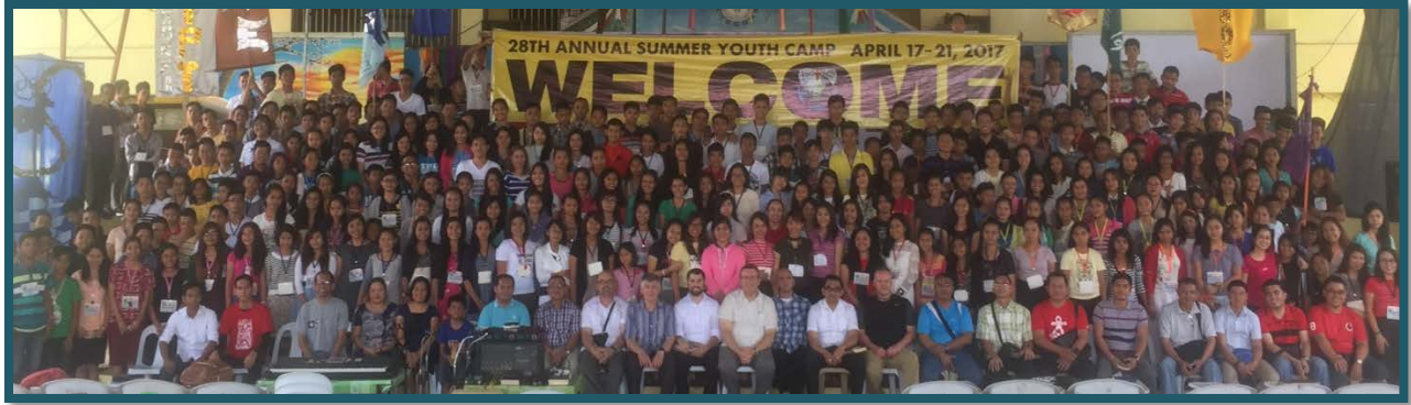
28 th Annual Summer Youth Camp hosted by Lapasan Baptist Church. Mission team is front and center.